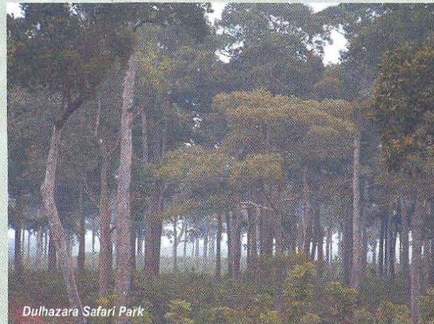
Dulhazara Safari Park

The Nishorgo Program aims to protect and conserve Bangladesh's forests and biodiversity for future generations. At the heart of Nishorgo is a focus on building partnerships between the Forest Department and key local and national stakeholders that can assist in conservation efforts.