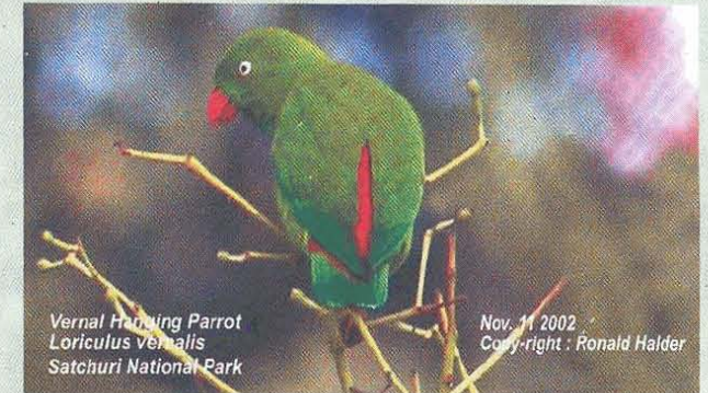
Vernal Hanging Parrot Loriculus vernalis Satchuri National Park