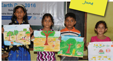
Students paint the biodiversity of Bangladesh on Earth Day, 2016