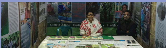
CREL participated in a fair organized by Ministry of Chittagong Hill Tracts Affairs, Bangladesh on the occasion of International Mountain Day 2016.

of meetings, each VCF selected two representatives to the People's Forum (PF) followed by the Forest Department Range Officer helping to form the People's Forum and selection of the PF representatives for the Co-Management Council on 14 November 2016. The People's Forum has a total of 20 members including 14 men and 6 women and the Executive Committee has 11 members with 8 men and 3 women. Lastly on 20 December the Co-Management Council and committee for Ratargul were formed, a major step forward in establishing co-management and improving protection of this unique forest.