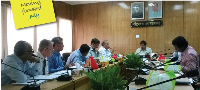
The first meeting of the project steering committee (Forest Part) of USAID's Climate-Resilient Ecosystems and Livelihoods (CREL) Project