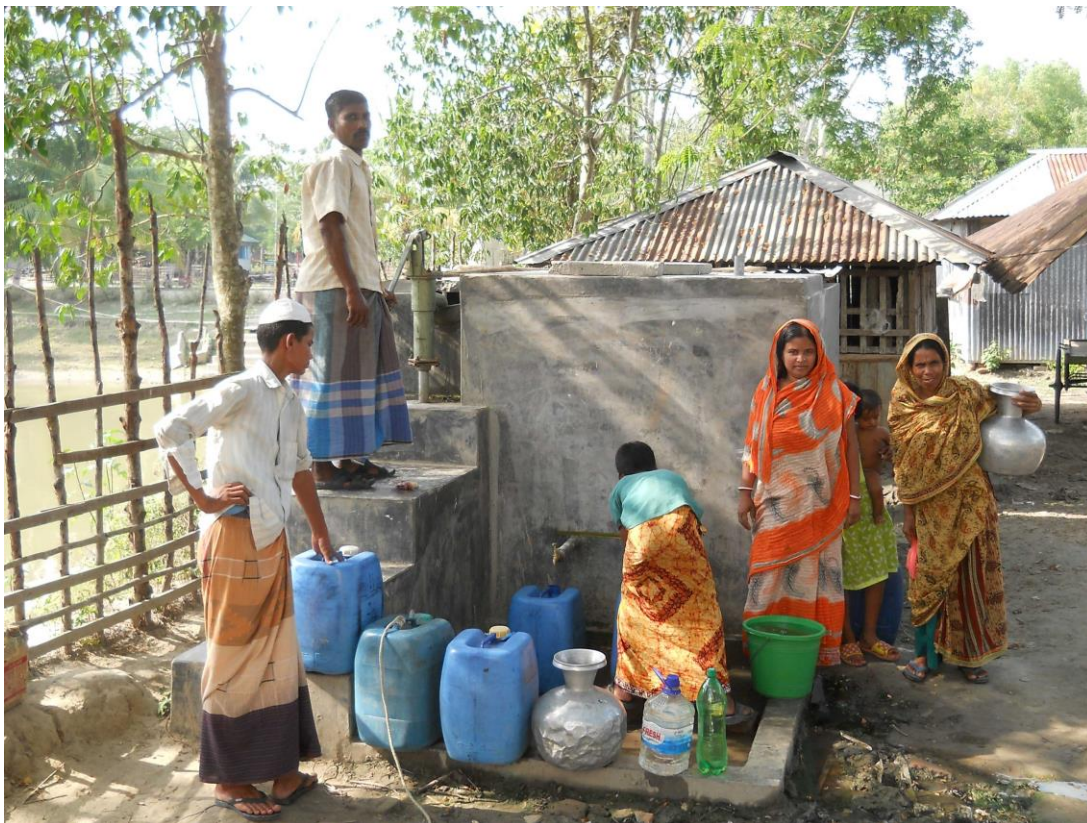
Activities of the project: The project comprised with 30 HHs for separate Passenger Vans, 1800 HHs for 3 ponds development.