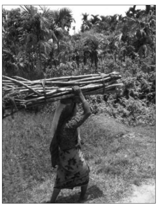
CMO play a critical role in gauging the needs of the marginalized for drawing sustenance from the PA, and advocating on their behalf. [Philip J. DeCosse]

CMOs have potential for serving as effective platforms for local conflict resolution and peace building. A good number of CMO members take part in local conflict resolution processes and mechanisms. This serves as an added advantage in the functioning of CMOs. The CMO leadership is, however, not very enthusiastic about playing an active role in the settlement or negotiation of various conflicts between the FD and local communities. The common "apples of discord" include: encroachments (and resultant lawsuits), boundary demarcation, and activities related to (forest) land use conversion (e.g. betel-leaf cultivation, excavation aquaculture. pond and establishment of brick kilns). While the