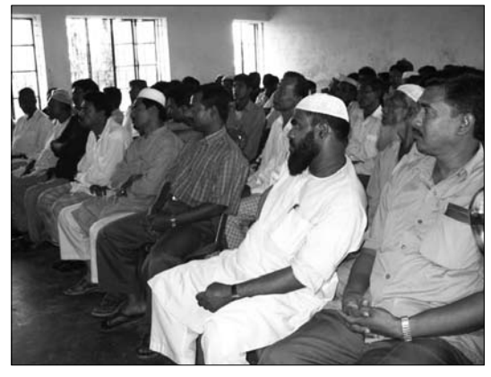
Women and youth were only cursorily represented in the CMOs [Philip J. DeCosse]

Training and skill enhancement initiatives need to be locally specific, tailor-made to local demand and context. A number of problems, which hinder the effectiveness of training programs, were identified during the course of discussions with the local people and project field staff, including the following: (i) Most recipients of training noted that it is difficult for them to leave their villages to attend training sessions; (ii) Some (mostly women) faced difficulty in following the training presentations, materials and handouts because of their low level of literacy; (iii) The timing of the training