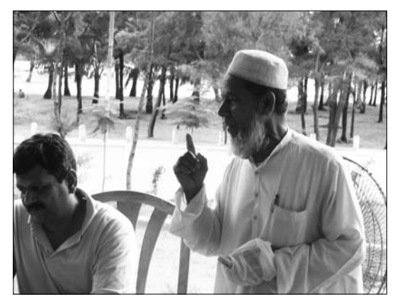
CMOs have potential for serving as platforms for conflict resolution.

The provisions for livelihood enhancement linked with the project are clearly insufficient, and the income generated from those alternative occupations supported falls far below the demand. These provisions are inadequate to make any substantive change in the livelihood status of the recipient households.