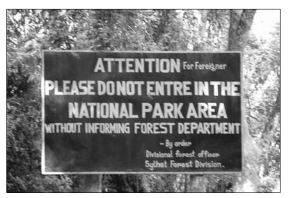
Sign at entrance to Lawachara National Park, 2003. The sign directs visitors to travel some 30 miles to get permission to enter the PA. Guidelines for managing PA visitors were not then widely understood.

Whether in the Wildlife Circle or territorial Divisions, FD staff members had little training or understanding of protected area management needs, and in most cases were scarcely familiar with the boundaries of the declared Protected Areas. Other than makeshift hand-painted signs at Satchuri and Lawachara, none of the five sites were demarcated and recognized as protected areas to the public. Indeed, the words "Protected Areas" in English were scarcely used except by those that had taken part in IUCN-supported processes (such as the World Parks Congresses), and had no clear and broadly understood Bangla translation either.