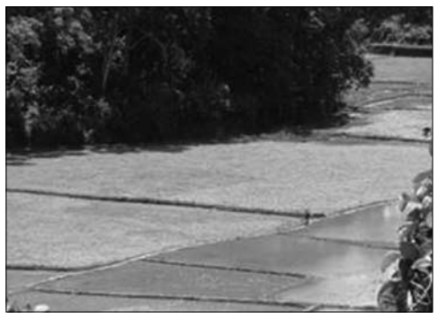
Rice cultivation inside Rema Kalenga Wildlife Sanctuary, 2003. Human interaction inside the PAs is a common feature throughout the system. [Philip J. DeCosse]

Recognizing the perilous situation of natural forests in the country, the Forest Department began some limited efforts in the 1960s to create forest Protected Areas from Reserve Forest lands. The largest increase in these declared Protected Areas (PAs) took place in the 1980s. By 2002, the PAs included seven National Parks, eight Wildlife Sanctuaries and one Game Reserve. Although these areas were brought under conservation status, few received matching investments in staff capacity, infrastructure, applied research, or conservation management. In