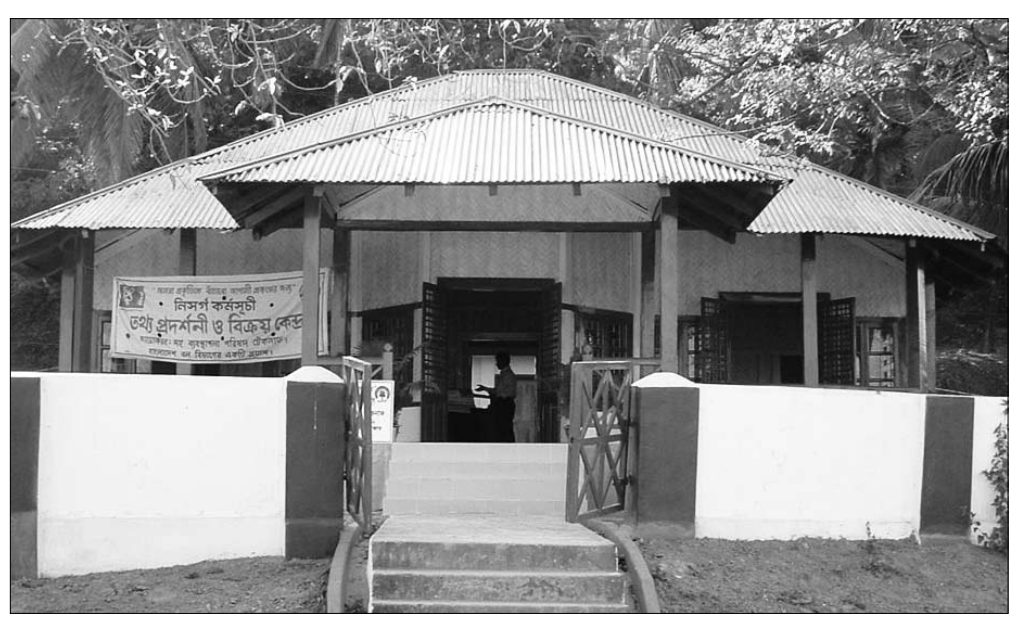
Forest Department staff bungalows like this one at Teknaf Wildlife Sanctuary were constructed in the 1920s. [Philip J. DeCosse]

Before partition of the Indian sub-continent in 1947, the forests of what is now Bangladesh were administered under Forest Circles of the Bengal and Assam Forest Departments. From 1947