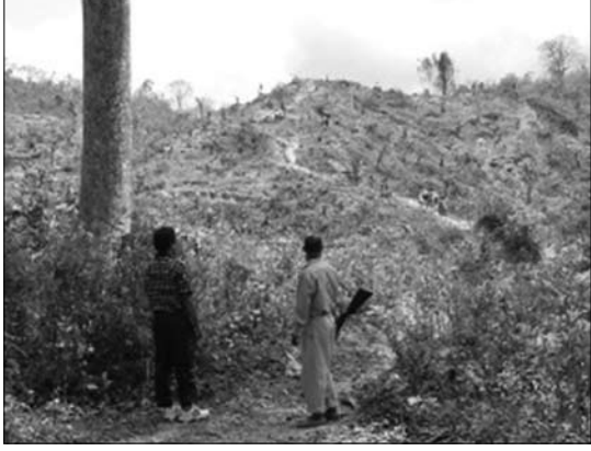
Just behind the Shilkali Garjan forest on west side of Teknaf in April of 2004, this Beat Officer observes the hillsides that have been prepared for a plot of social forestry.

and use. National Parks are identified as areas of "outstanding scenic and natural beauty with the primary objective of protection and preservation of scenery." Hunting, capture, or disturbance of wild animals, firing of guns, burning, cutting or damaging plants or trees, clearing land for any purpose, or polluting water are prohibited. Similar provisions apply also to the Wildlife Sanctuaries and Game Reserves, and the Act allows little scope for formally allowing a collaborative governing structure, or any formal inclusion of neighboring communities in the decision-making process for Protected Areas