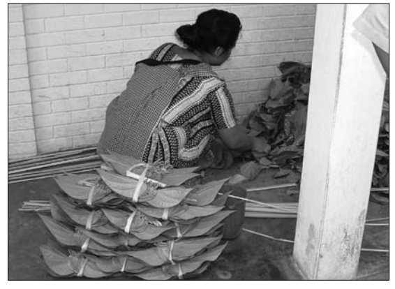
Betel leaves from Lawachara National Park's Maghurchara Khasia Village are packaged for sale. Rising demand for these and other forest products placed increasing pressure on the PAs.

Bangladesh had made significant progress in reducing poverty levels in the two prior decades, but the number of people living in poverty was still very high. According to the World Bank "Poverty Assessment for Bangladesh,"