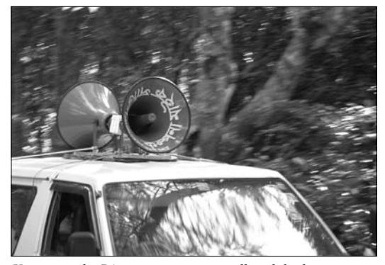
Visitors to the PA are increasing rapidly, while the size of the PA are small. Here, in 2003, advertisements are broadcast to visitors by a car driving through the Lawachara National Park.

And the rate of increase in paying visitors at these sites provided a telling glimpse into the demand for a nature experience from the Bangladeshi population. Even in 2003, the number of paying weekend visitors to the small Dulhazara Safari Park exceeded 20,000, while the small Sitakunda Eco-Park was receiving 15,000 paying visitors