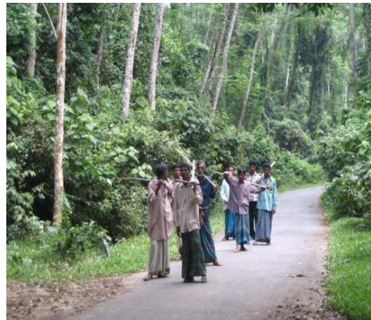
Que t j vDqvQov RvZxq D` vtb Kgyjwbuw tctUhwj s

Kgyjwbuw tctUhwj s tkb c0qvRb t ebnAtji wfZti | Avtkcvtk RbtMw0i emevm | ebnAtji Dci Pvc GUV iay evsj vt` tki tqtTb bq wektji Ab`vb` t` tkl weivRgvb | ZvB wek; cvK`KstMfm (1993, 2003) GUV `fKZ ntqtQ th, eZ0vb Ae`vi tctTtZ `vbxq Rbmviavi tYi AskM0Y e`ZxZ ebnAtj i qv Kiv m`e bq | G0vov eb Av`Bi KZR 1995 mtb c0YxZ eb gnvcwi Kíbvq ebR m`úf` i Pvn`v tgUvfbv, Rxe%epT` msi qv | I eb e`e`vcbvq `vbxq RbtMw0i AskM0Y wbu0Z Kiv ntqtQ | tKbbv etbi wfZi | etbi Avtkcvtk emevmKvix RbtMw0i