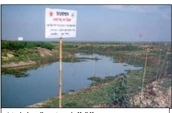
A typical small sanctuary in Hail Haor.

1. Most have been established by the RMOs within water bodies (jalmohals) where they hold the fishing rights for 5-10 years. These sanctuaries are part of local management plans and are designed to restore fish catches for the local communities represented by the RMO. Typically they are a small but vital part of the water body that retains water through the dry season and overall cover about 1.9% of the dry season water area of the MACH sites.