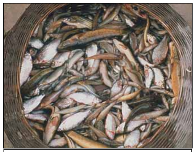
A typical catch of small fishes

Kangsha-Malijhee site (3% of maximum inundated area)<sup>3</sup>. Each sample location was surveyed for three days every month. Within that defined area separately operating fishing units (which may be one or several people) were recorded according to the equipment (gear) they used for fishing. For three fishing units of each gear type or 10% of units of that type (whichever was the higher figure) the gear type and characteristics, expected duration of fishing, and catch by number and weight of fish were recorded. The sample area catches are taken to be representative of the whole wetland system and the total catch estimate for the sample areas multiplied up by the fraction of the total area gives an estimate of total catch.