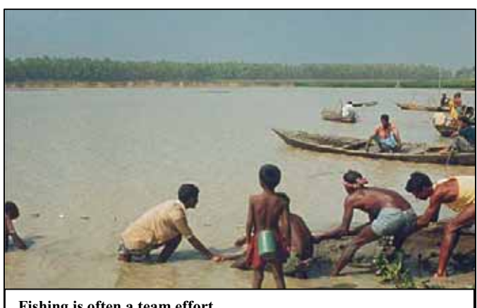
Fishing is often a team effort

Hail Haor is located in north-east Bangladesh and is typical of deeply flooded basins in that region known as haors. It is in the anticline between the Balishara and Barshijura Hills to the east and the Satgaon Hills to the west. Water originates from the surrounding hills and flows through 59 streams