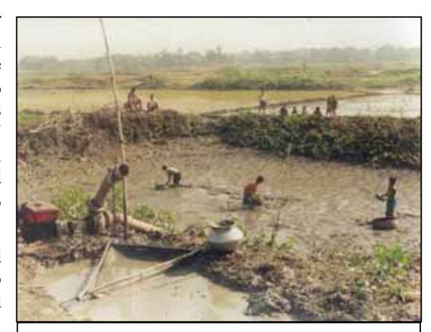
Fishing by dewatering – a common practice that removes all the next year's broodstock

The future prospects for freshwater wetlands and fisheries in Bangladesh look bleak if there is no change in the current trend. A recent review found that fish consumption fell by 11% between 1995 and 2000 (but by 38% for the poorest households), and estimated that inland capture fisheries catches