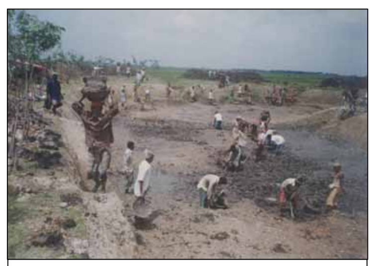
About 1.8 million person days of work was created through manual excavation of silted up wetlands

To address this adverse trend, wetland habitat has been restored by re-excavating canals to improve